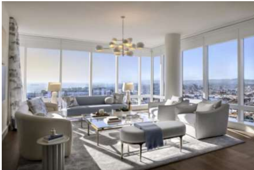
Interior of the new Four Seasons Private Residences in San Francisco.

Twelve years in the making, the highly anticipated Four Seasons Private Residences at 706 Mission, San Francisco is now open and welcoming its first residents. Located in the city's Yerba Buena District, the ambitious project includes the historic Aronson Building reimaged as luxury residences and a newly constructed tower featuring estate-style homes.