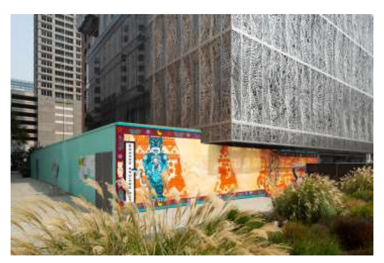
Close-up image of podium details, Four Seasons Private Residences at 706 Mission