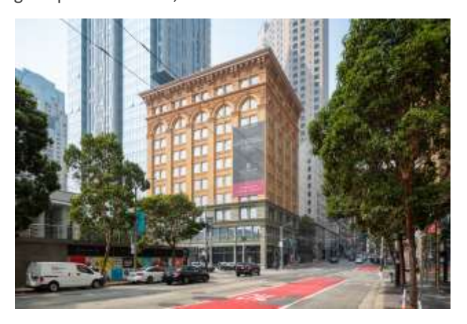
The Aronson building