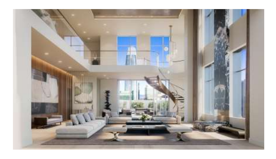
Rendering of the Grand Penthouse